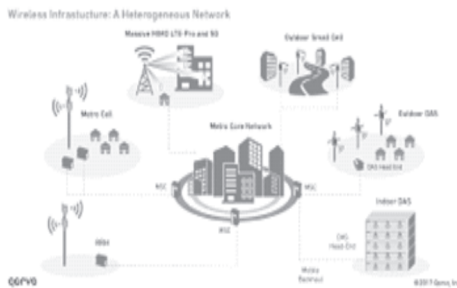
Figure 2. Coverage areas

In the actual framework foundation which is created to various minimal nodes destinations, one large scale node site and one EPC site.