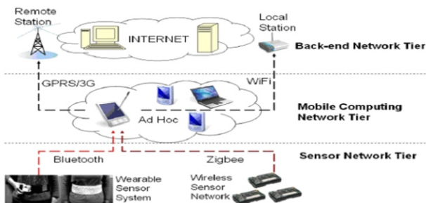
Figure 2. MANET Communication

MANET is an infrastructure-less network, where nodes are free to move randomly at any given time. MANET interconnection between the nodes can change rapidly. Nodes in MANET cooperate among multi-hop communications. In biosensor networks, devices form a self-creating, self-organizing and self-administering wireless network called a mobile ad hoc network (Fig 2). In MANET the future essential features are flexibility, freedom from infrastructure, ease of deployment, auto-configuration and low cost.